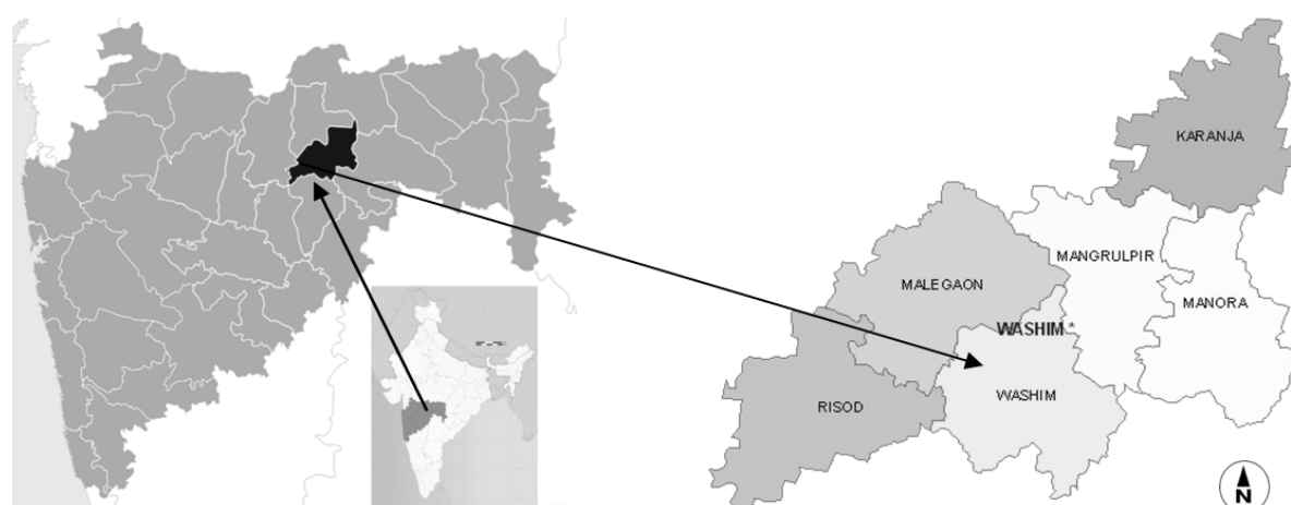
Fig. 1. Location of study area