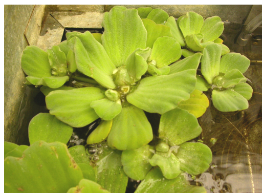
(b) water lettuce