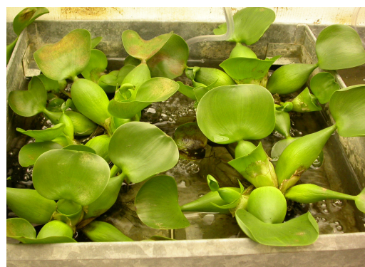
(a) water hyacinth

and water lettuce, respectively. Sooknah and Wilkie [13] investigated the use of water hyacinth and water lettuce plants for reducing the nutrient content of an anaerobically digested dairy manure. After 31 days of batch growth, the researchers reported biomass yields of 1608 and 30 g (dm) m -2 for water hyacinth and water lettuce, respectively.