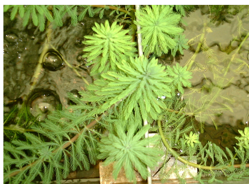
(c) parrot's feather