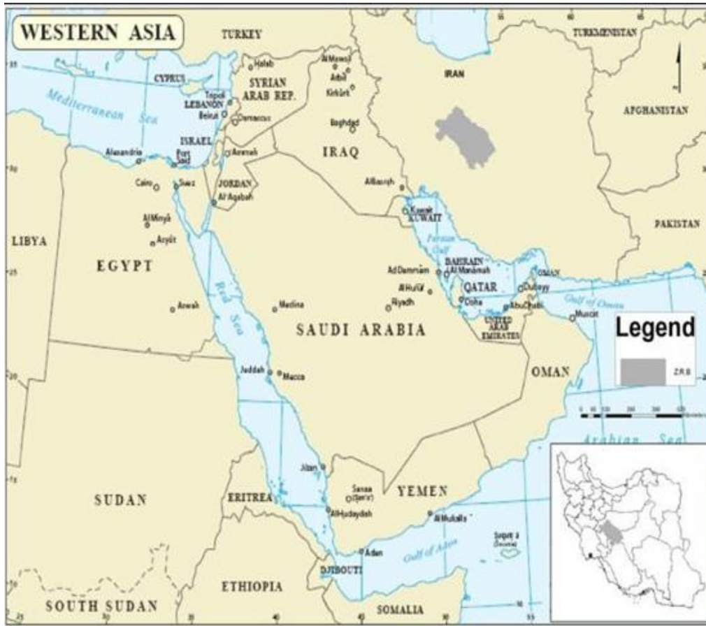
Fig. 1: Location of Z. R. B in Iran (Barzani and Khairulmaini, 2013)