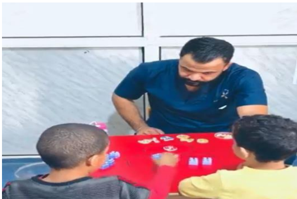
Fig. 1: Learning session for autistic children