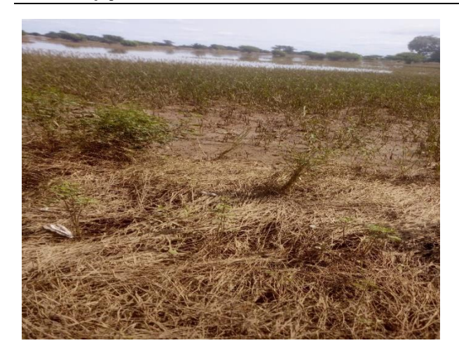
Fig. 3: Maize farm destroyed in googo