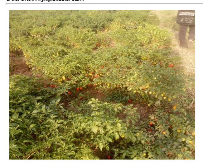
Fig. 5: Pepper farm in yarigu